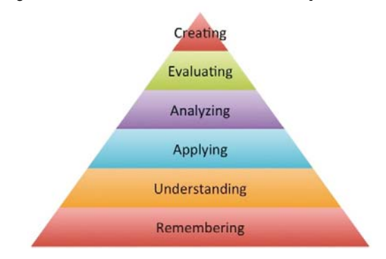
Figure 2. The new version of Bloom's taxonomy